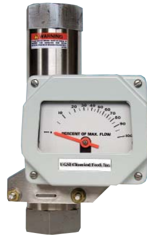
Armored flowmeter with NPT connections

The standard readout is in a magnetically coupled indicator unit. Optional 4-20 mA transmitter and alarm switches are also available.