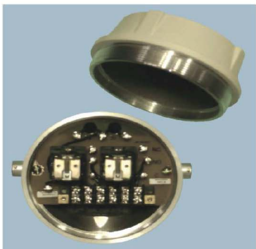
Hazardous Location version (two switches and relays)

The UGSI External Flow Switch is a compact option that gives reliable high- and/or low-flow switching. The External Flow Switch contains a powerful rotating magnet that responds linearly to float position. Its switches are long life, hermetically sealed reed types. Almost frictionless rotation of the switch magnet and its powerful bond with the float magnet give a dependable magnetic coupling. Even under sudden flow surges, switching remains reliable.